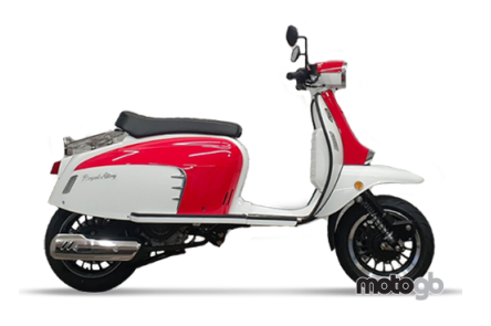
More colours available